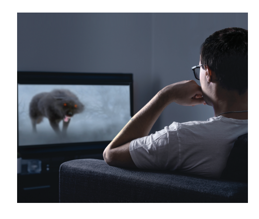
Why would we want to feel scared—on purpose? The answer lies in an ancient, primal response: fear can be biologically invigorating.

Why would we want to feel scared—on purpose? The answer lies in an ancient, primal response: fear can be biologically invigorating. But unlike scary movie fans, most investors don't look forward to getting scared. Instead of being invigorating, fear can cause us to make panicked investment decisions. By understanding our biological response to fear, you can prevent fear from negatively impacting your judgment.